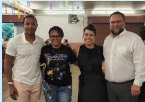
Northside Leadership Conference annual dinner event.