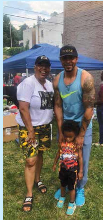
Stop The Violence block party in the Hill District.