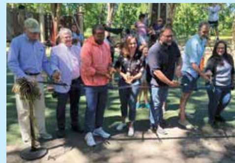
Above: Ribbon-cutting at Northside Park.