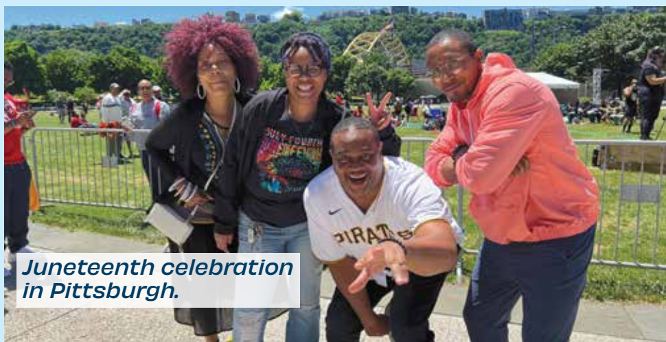
Juneteenth celebration in Pittsburgh.

So please stop by the office any time at 2015 1st Floor, Centre Avenue, Pittsburgh, or call us at 412-471-7760!