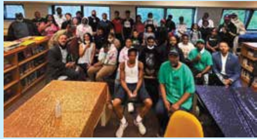
Supporting University Preparatory School, Millions 6-12 Take a Father to School Day event!