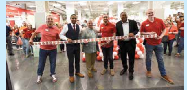
Opening the new Target in Downtown!