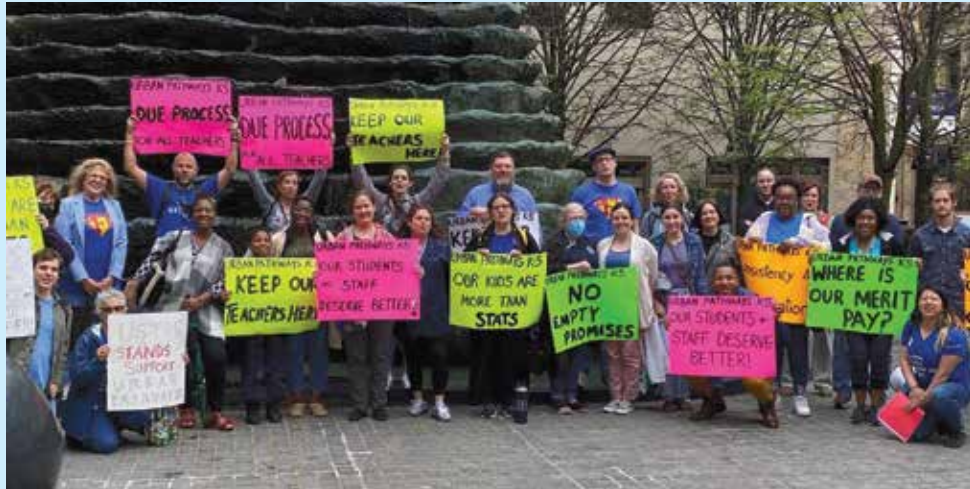
I joined with the teachers at Urban Pathways K-5 in their rally to be certified to join the AFT-PA union and keep their teachers at the school.